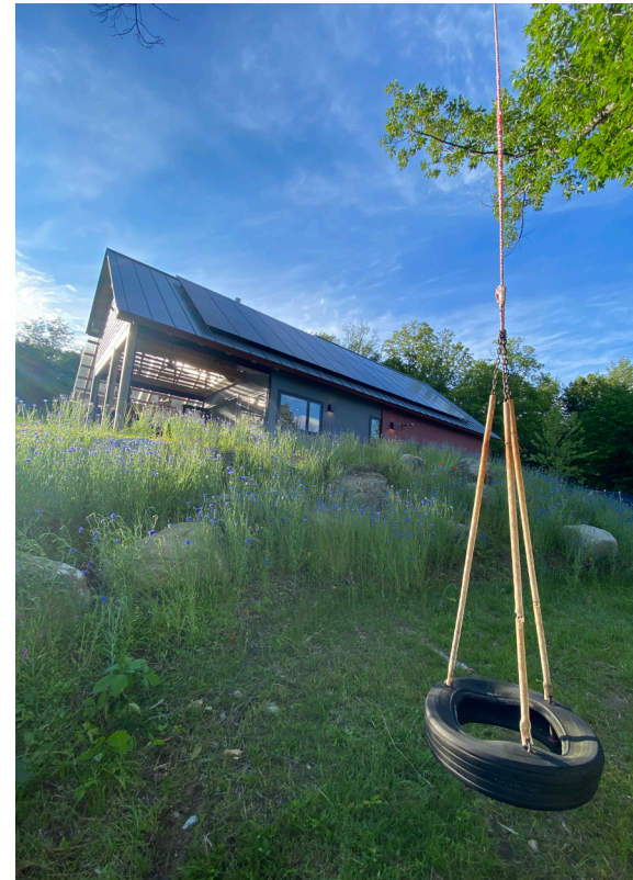
More photos from The Bluegrass Barn